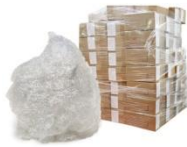
PALLET WRAP STRETCH FILM