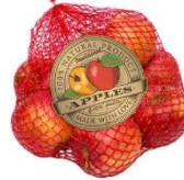
NET OR MESH PRODUCE BAGS