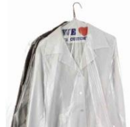
DRY CLEANING BAGS