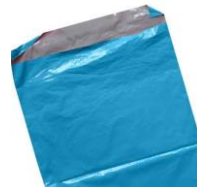
PLASTIC SHIPPING ENVELOPE