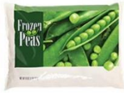
FROZEN FOOD BAGS