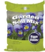
MULCH OR SOIL BAGS